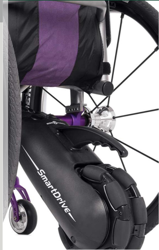
Highlighting Technology to Improve the Life of our Clients